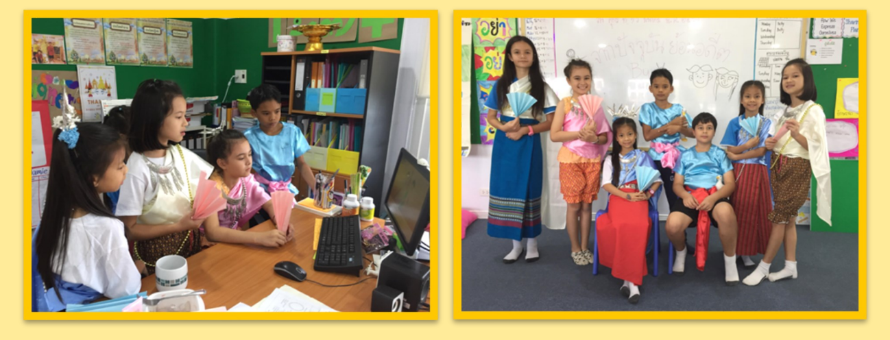
Year 5, we demonstrated Thai culture and read Thai poems in Thai costumes.