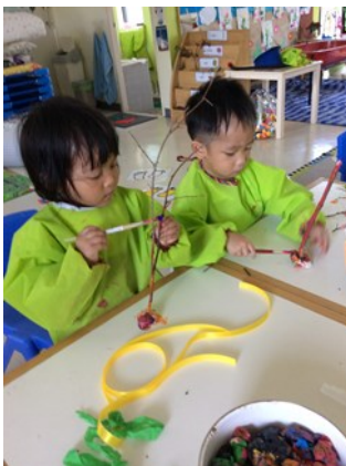
Glacier and Enrich