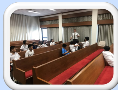
We saw the room where people prayed, sang songs and listened to readings from the Bible