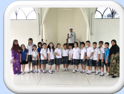
Worshippers pray facing facing Mecca The Imam uses a microphone when speaking