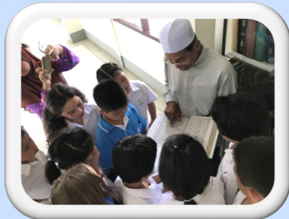
The Imam explained how he read the Koran.