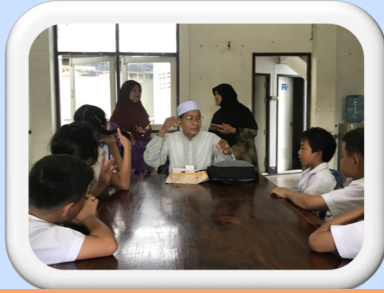
The Imam is the leader of the mosque.