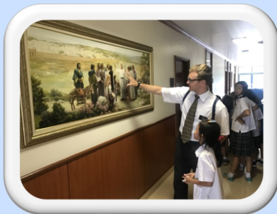
e saw pictures from bible stories at the Christian Church.