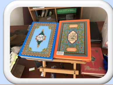
The Koran is the holy text of Muslim