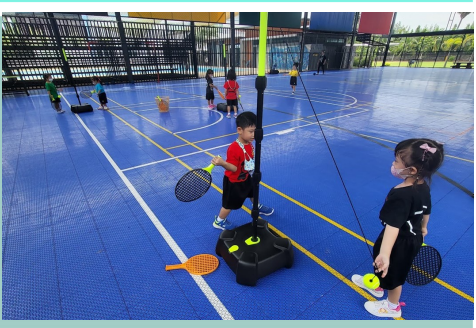
PSPE: Striking skills

Our EY students have been learning about striking skills in PE. They learned how to strike things using a tennis racquet including tennis balls, shuttle-cocks and volleyballs. It was a great chance for them to start to develop their hand-eye coordination skills.