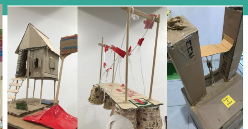
Thai Stilt House